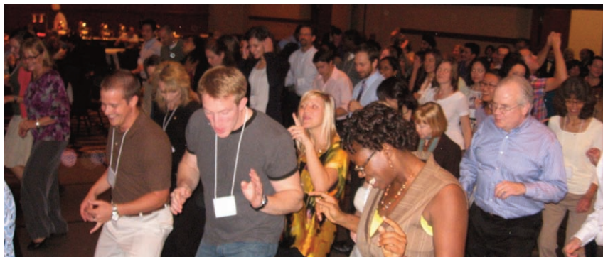
Line dancing Texas style.