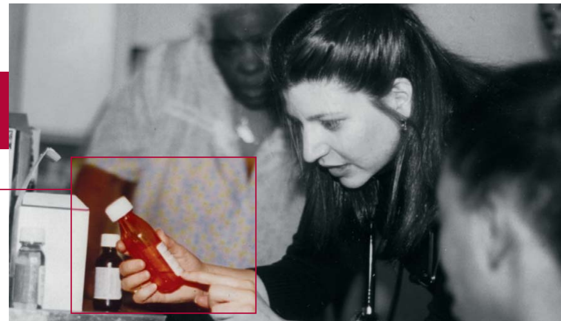
A resident explains medications during a home visit to an elderly patient.