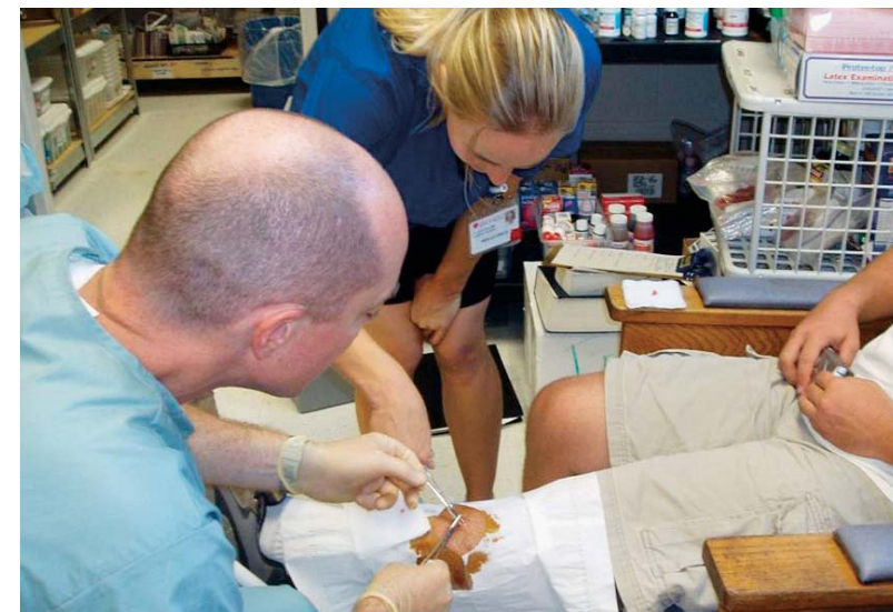
At a temporary clinic in Waveland, MS, a University of Rochester student tends to a local resident...

The Gold Foundation will continue to fund Katrina Assistance projects through 2006.