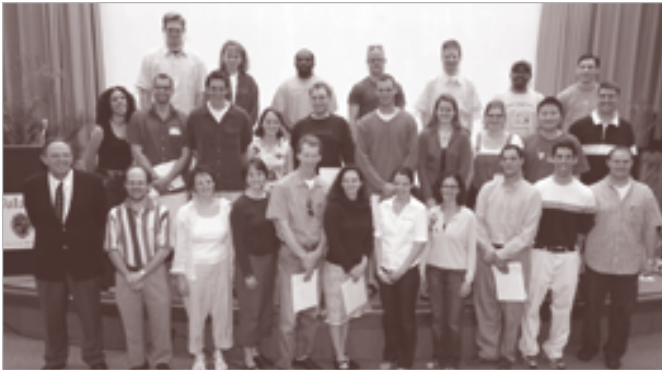
(Bottom) Charter inductees at the Tulane University School of Medicine.