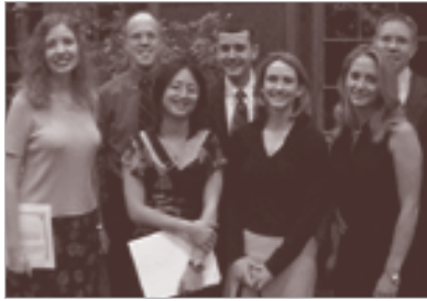
(Top) Six of the seven charter inductees (and one spouse) from the Chapman Chapter of the University of Florida College of Medicine:

The Gold Humanism Honor Society (GHHS), founded in 2001, recognizes exemplary devotion to the service of others, integrity, clinical excellence, and compassionate and respectful relationships with patients, families and colleagues. 177 new members were inducted to chapters at 13 medical schools this year.